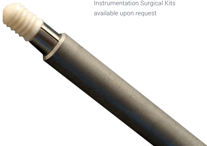
BacFast HD on Inserter Instrumentation Surgical Kits available upon request

BacFast HD is a facet stabilization dowel designed with a focus on osteoconductivity and preventing graft migration, making it an ideal graft to be used as a complement to common spinal fusion procedures as it preserves the posterior spine. Utilizing Bacterin's proprietary demineralization technology, BacFast HD is hyper-demineralized to expose the growth factors and BMPs inherent to cortical bone. With the benefits of HD technology and increased collagen surface area, BacFast HD also provides the graft with osteoinductive properties without compromising the structural integrity of the graft.